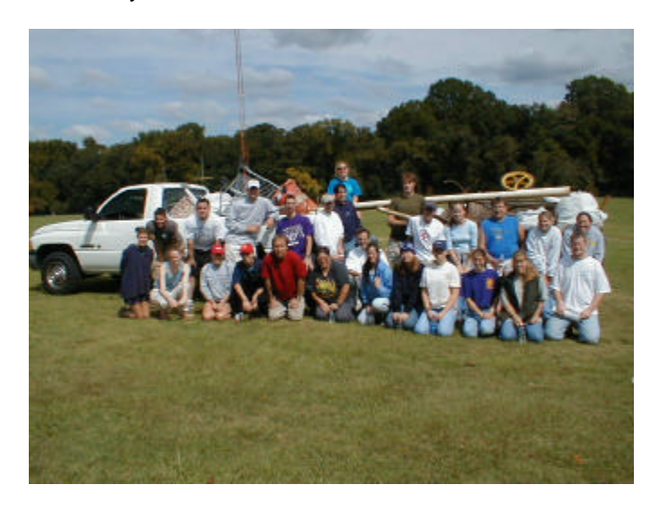
The ECU-AFS Greenmill Run crew and their haul.

The fall semester is off to a great start here at ECU. Once again we collaborated with Pitt County Solid Waste to help in the nationwide project, "Big Sweep". This was a record –breaking year with almost 200 people volunteering, 60 of which were ECU faculty, staff, and students. On September 15 everyone donned hipboots and chest-waders and picked up over 7000 pounds of trash from the Tar River and its tributaries. Of special interest to ECU folks is Greenmill Run, a tributary through the middle of campus and a favorite outdoor site for fisheries and water quality labs. Thirty-five students were directly involved in this effort. A pizza party and raffle followed the event, and everyone had a great, if not muddy, time.