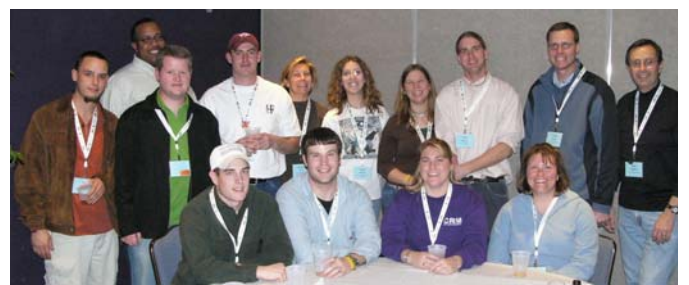
ECU-AFS members and alumni at the 2005 AFS Southern Division Meeting, Virginia Beach, VA.

members to host the 5th Annual Colloquium in November 2005. Of course, we accepted it! Planning for this event will begin this summer and ECU-AFS is thankful for the support offered by the West Virginia University and NC State AFS student subunits. This will certainly be an exquisite accomplishment for ECU-AFS.