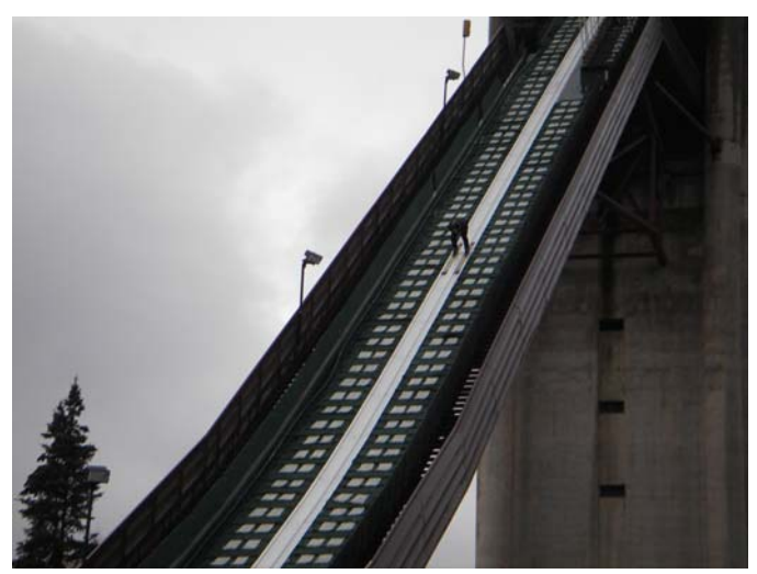
A Lake Placid skier zooms down the 100-m ski jump for AFS attendees.

Just down the mountain were the large ski jumps, and teenage boys from Lake Placid were practicing for a meet in Chicago. A number of Tidewater members climbed to the top (stopping several times) to get a better view, and believe me, you couldn't pay me enough money to get on to a couple of wooden slats, zoom down a long steep incline with those slats between two plastic groves, and then fly into the air through the rain and land on a slope so steep you'd have to be a mountain goat with two short legs in order to stand up straight.