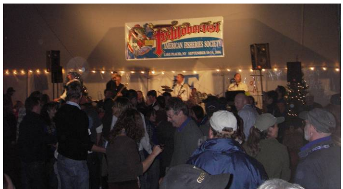
Dancing and bratwurst were common at the Wednesday night festivities in Lake Placid.

My understanding was that the Lake Placid meeting was the second largest attendance ever, after Anchorage last year. Next year is San Francisco, so start writing those abstracts!