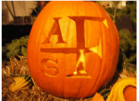
An "AFS pumpkin" from the Wednesday night banquet/party in Lake Placid – "Fishtoberfest". Ooh, scary!