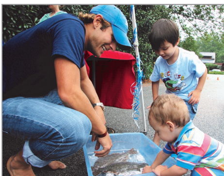
UNKNOWN | DUKEFISH

DukeFish has pursued other activities in addition to our CSF initiative, such as sending six members to the Parent Society an-