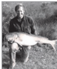
DAILY PRESS WEB SITE

He headed the VIMS Anadromous Fishes research program and was a well-known expert on the biology and conservation of American shad. Along with his students and collaborators, he published 25 papers on American shad and was prin-