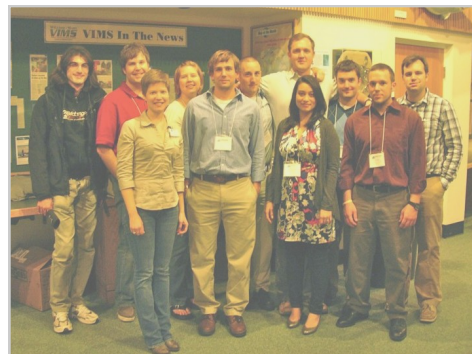
ECU-AFS WEBSITE PHOTO GALLERY

In the spring, we had a table with fun fishy facts and games at an ECU event called "Barefoot on the Mall." A pre-exams stress relief campus "party," the event is a great opportunity for campus groups and organizations to educate students about